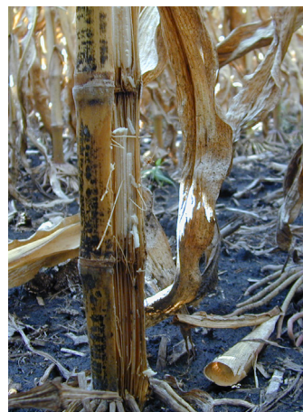
Figure 4. Symptoms of Anthracnose stalk rot phase include shiny black blotches streaked on the stalk surface. Internal stalk tissue may become black and soft, starting at the first and/or second node.

In cases where water availability is reduced in the soil, top leaves tend to dry down and die because of reduced water supply.