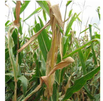
Figure 2. Top dieback phase of Anthracnose.