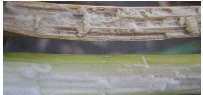
Figure 3. Comparison of diseased pith on top and healthy pith on the bottom.