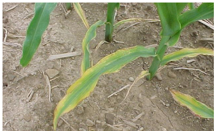
Figure 5. Potassium deficiency in corn.