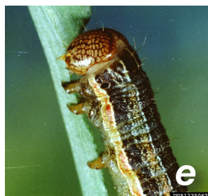
Figure 1. (a) European corn borer, (b) southwestern corn borer, (c) western bean cutworm, (d) corn earworm, (e) fall armyworm.