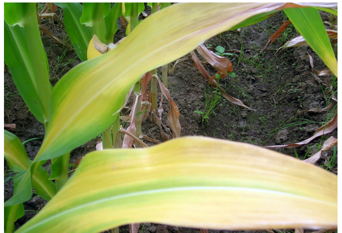
Figure 4. Nitrogen deficiency in corn.

The most common nutrient deficiencies observed late season are nitrogen and potassium. Both nutrients are mobile in the plant and are translocated to newer growth. Nitrogen deficiency symptoms appear on leaves as a V-shaped yellowing, starting at the tip and progressing down the midrib toward the leaf base (Figure 4). When deficient, nitrogen can be translocated from the stalk to the developing kernels, resulting in weak stalks and predisposes the stalk to infection by stalk rot pathogens. Potassium deficient plants exhibit a yellowing and necrosis along the margins of the leaf on older leaves but may not exhibit symptoms on newer growth (Figure 5). Potassium deficient plants are also predisposed to lodging as potassium plays a role in maintaining stalk integrity.