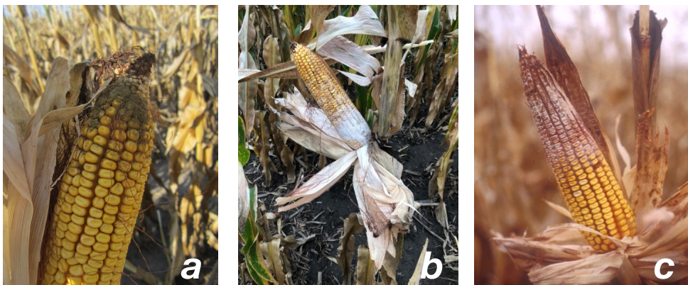
Figure 3. (a) Aspergillus ear rot, (b) Diplodia ear rot, (c) Gibberella ear rot.

Scouting during late season grain fill can help prioritize fields for harvest and identify possible management tactics to help reduce the incidence for the following year. The pinch or push test can be used to evaluate stalk strength and provide an indication of possible plant lodging by randomly assessing at least 100 plants per field.