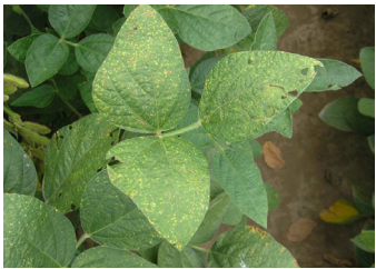
Downy Mildew (Stages II, III)