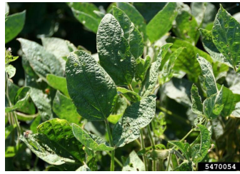
Soybean Mosaic Virus (Stages I, II, III)