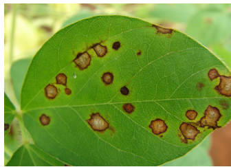
Frogeye Leaf Spot (Stage III)