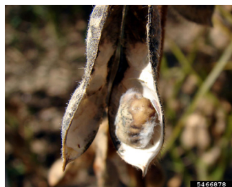
Phomopsis Seed Decay (Stage III)