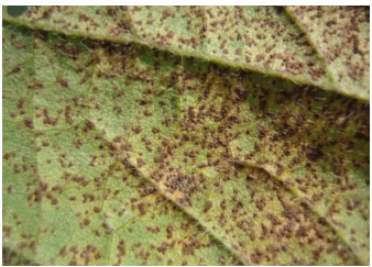
Asian Soybean Rust (Stage III)