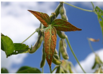
Cercospora Leaf Blight (Stage III)