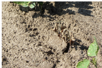
Pythium Seed Decay/ Damping Off (Stage I)