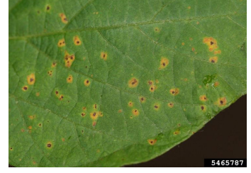
Bacterial Pustule (Stages II, III)