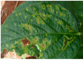
Bacterial Blight (Stages I, II, III)