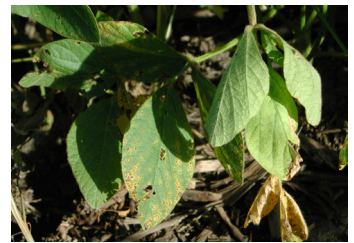
Septoria Brown Spot (Stage III)