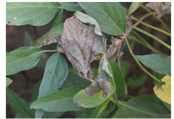
Aerial Blight (Stage III)