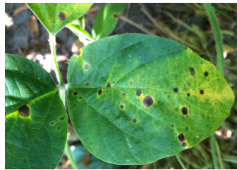
Target Spot (Stages II, III)