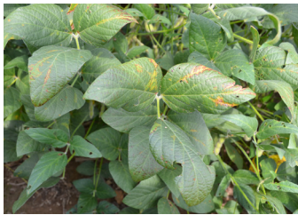
Soybean Vein Necrosis Virus (SVNV) (Stages II, III)