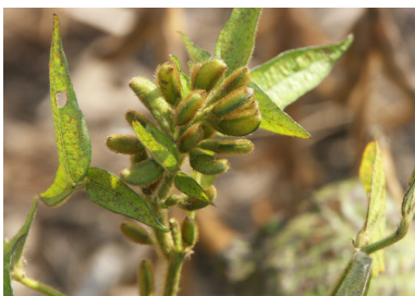
Bud Blight (via Tobacco Ringspot Virus) (Stage III)