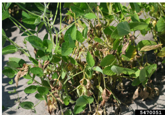
Fusarium Seedling Blight (Stage I)