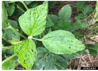
Bean Pod Mottle Virus (Stages I, II, III)