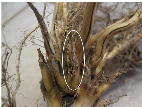
Figure 1D. Heavy root feeding by CRW.