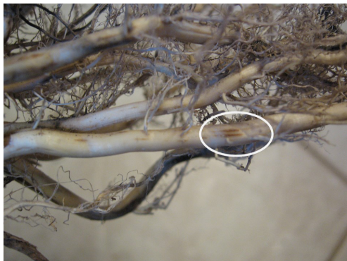
Figure 1A. Extent of damage on root mass.

Figure 1D shows a closer view of heavy feeding from CRW. The appearance of this type of feeding is different from the visual effects of mechanical injury that might occur during the digging process.