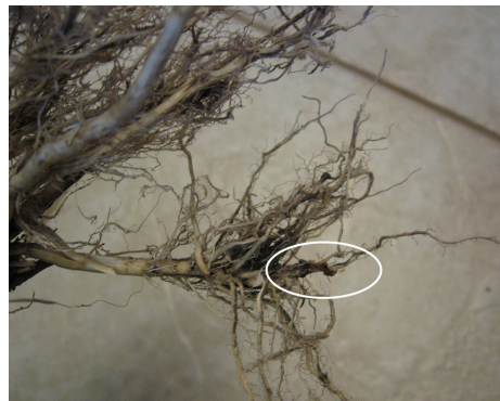
Figure 1B. Root tips had been eaten by CRW.