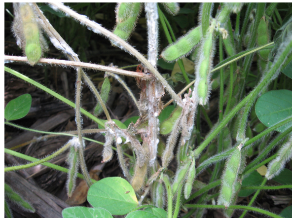
Figure 2. Frogeye leaf spot (left), white mold (right) symptoms on soybean plants.