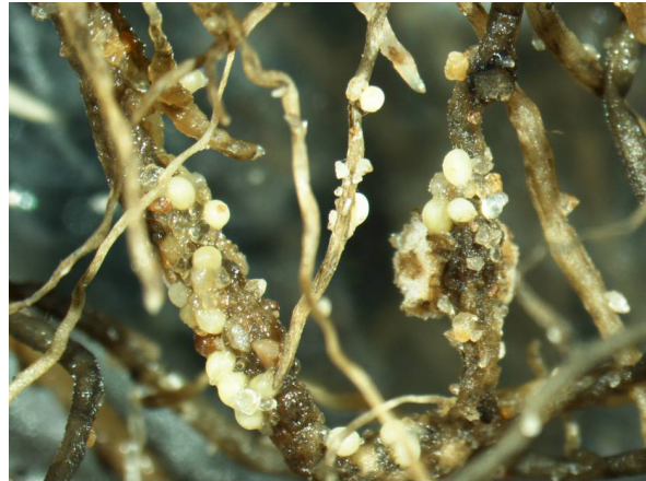
Figure 4. SCN symptoms on soybean roots.