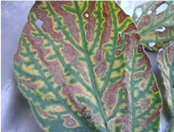
Figure 3. SDS symptoms with interveinal yellowing and necrotic spots.

Sudden death syndrome (SDS) is a disease associated with cool and saturated soil conditions, which are common in an early growing season. Selecting a soybean product with SDS tolerance may help reduce the risk of SDS infection early in the season and development later in the season (Figure 3). Soybean products that are resistant to soybean cyst nematodes (SCN) (Figure 4) can also help, since the presence of SCN has been associated with increased SDS incidence.